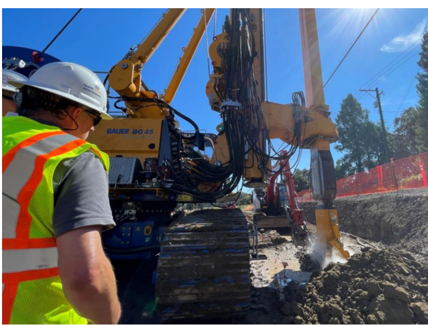
Reach A: Breaking ground for cutoff wall demonstration section.