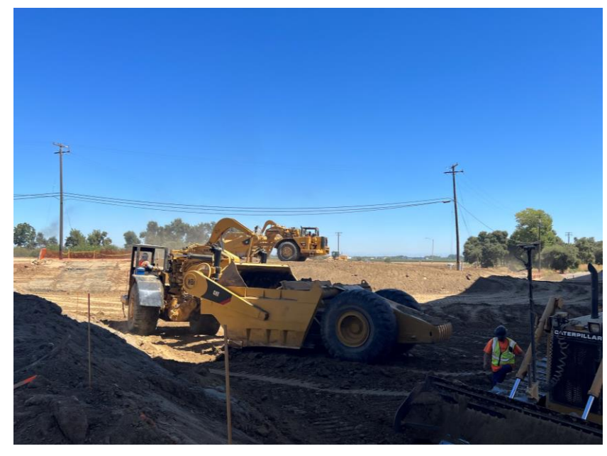
Reach B I-5 Window: Contractor backfilling project site at Interstate 5 cross over